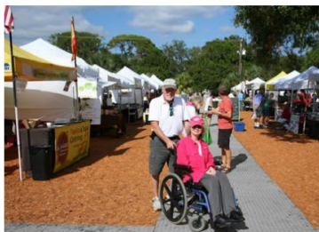
Mobi-deck™ fair in the New Jersey, USA