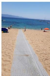
Mobi-deck™ on the beach of Ajaccio - France