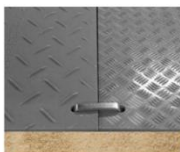
Double aluminum connectors (create a platform)